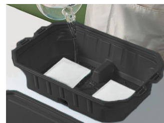
2. Add room temperature water cover heating pack (around 1-2cm)