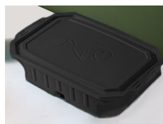
4. Cover and wait for 5-8minutes