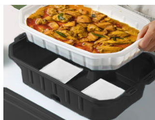
3. Place the food tray into the black box.