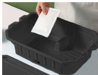
1. Put the heating pack into the black box